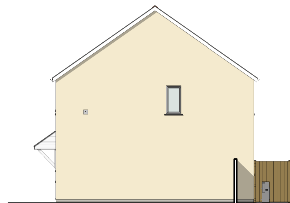
NORTH WEST elevation 1 : 100