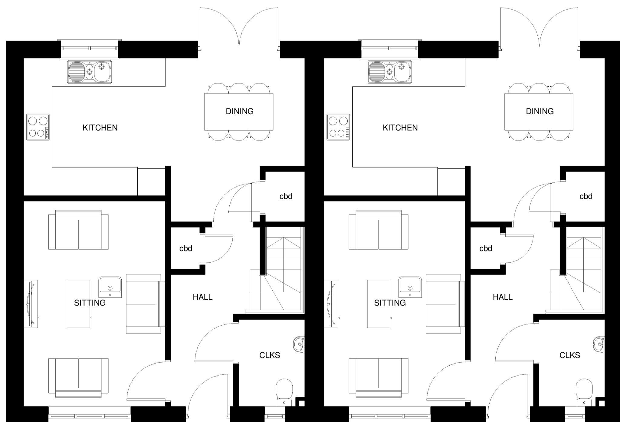
GROUND FLOOR layout 1 : 50