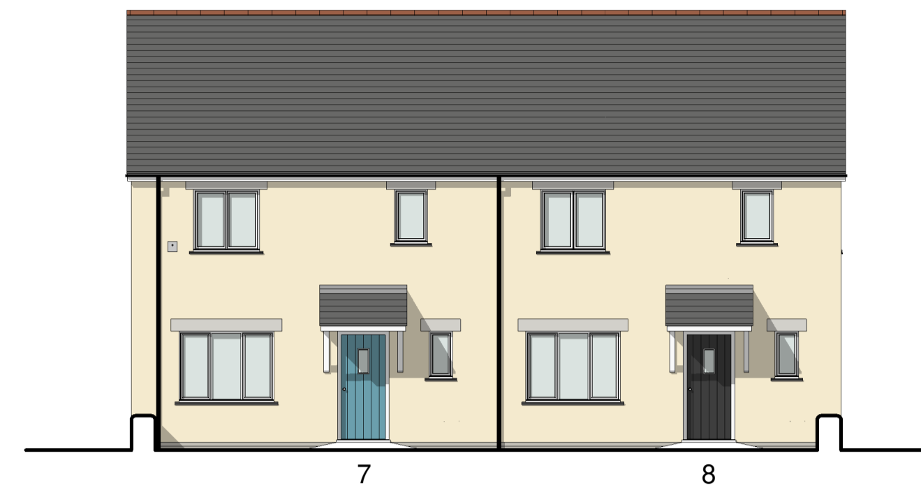
NORTH EAST elevation 1 : 100