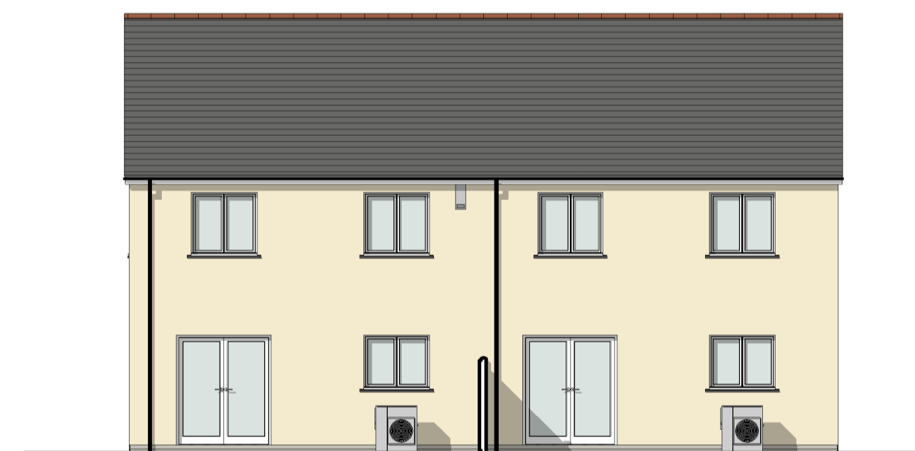
SOUTH WEST elevation 1 : 100