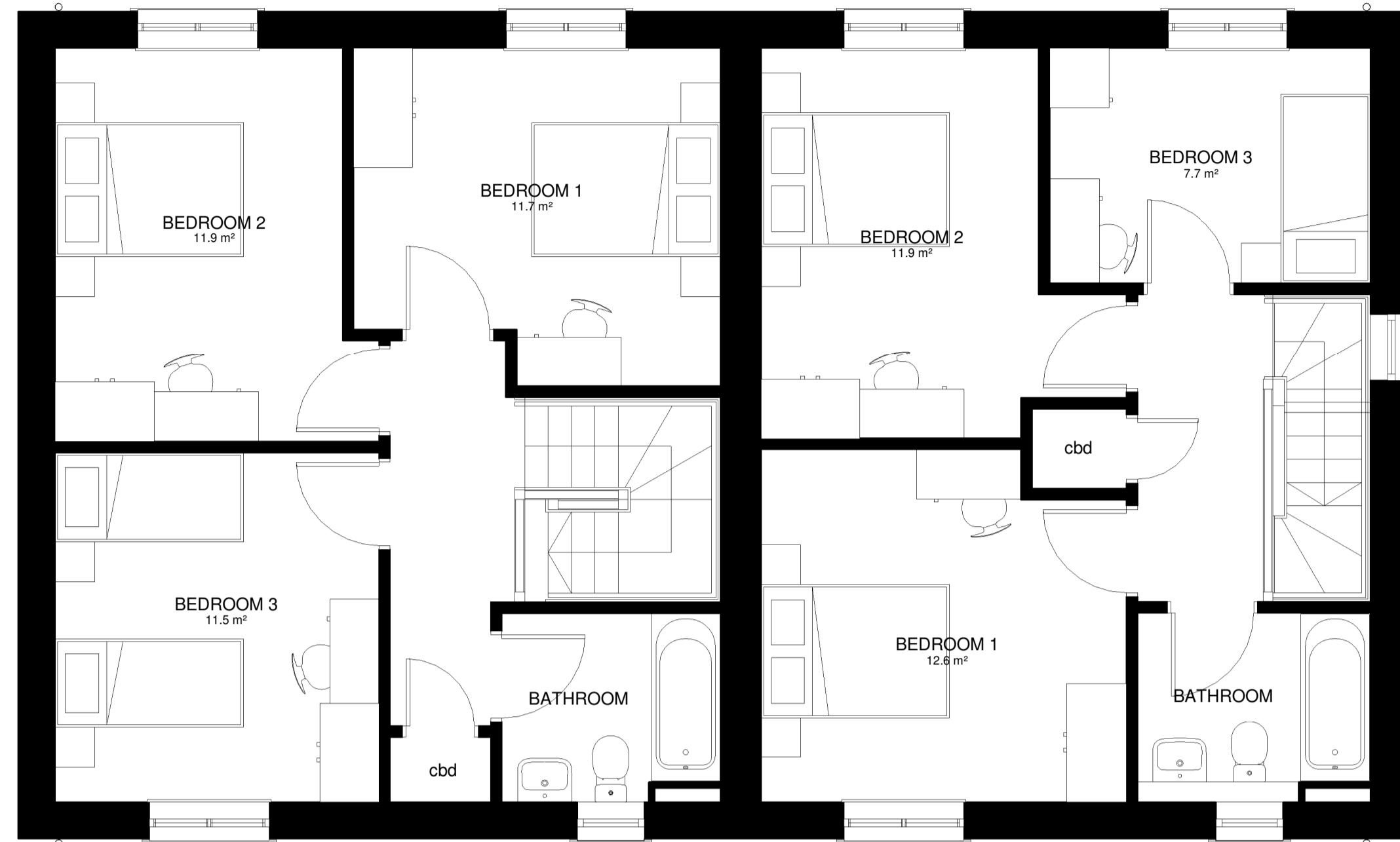
FIRST FLOOR layout 1 : 50