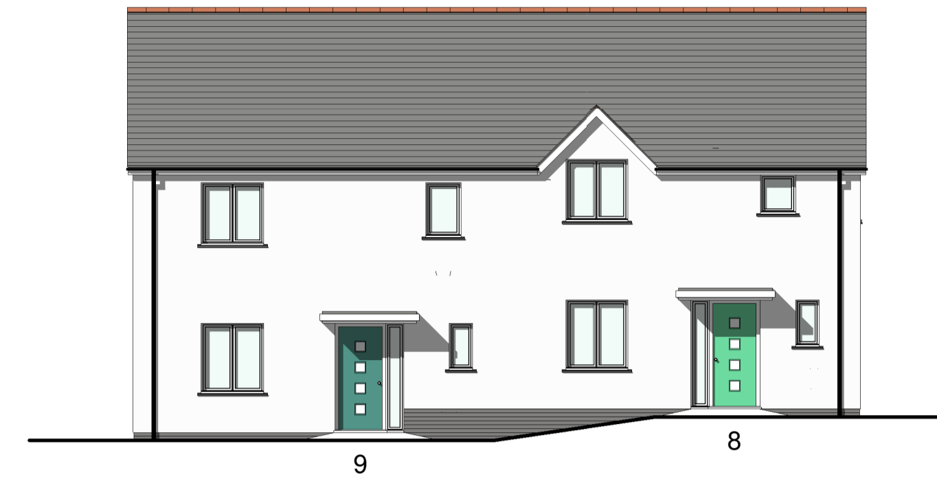
SOUTH EAST elevation 0 2m 1 : 100