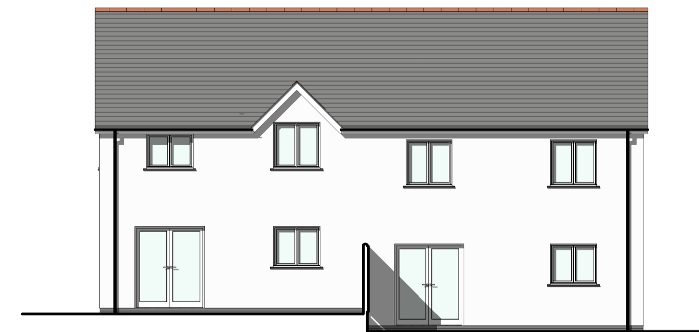
NORTH WEST elevation 1 : 100