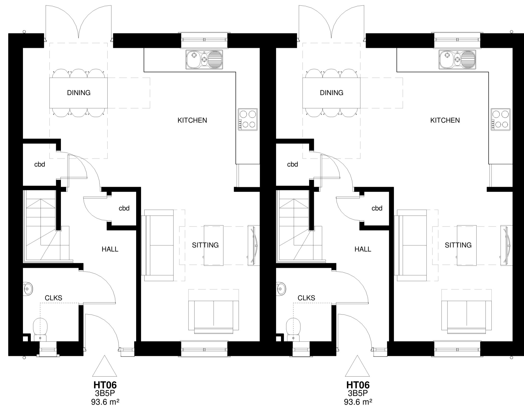
GROUND FLOOR layout 1 : 50