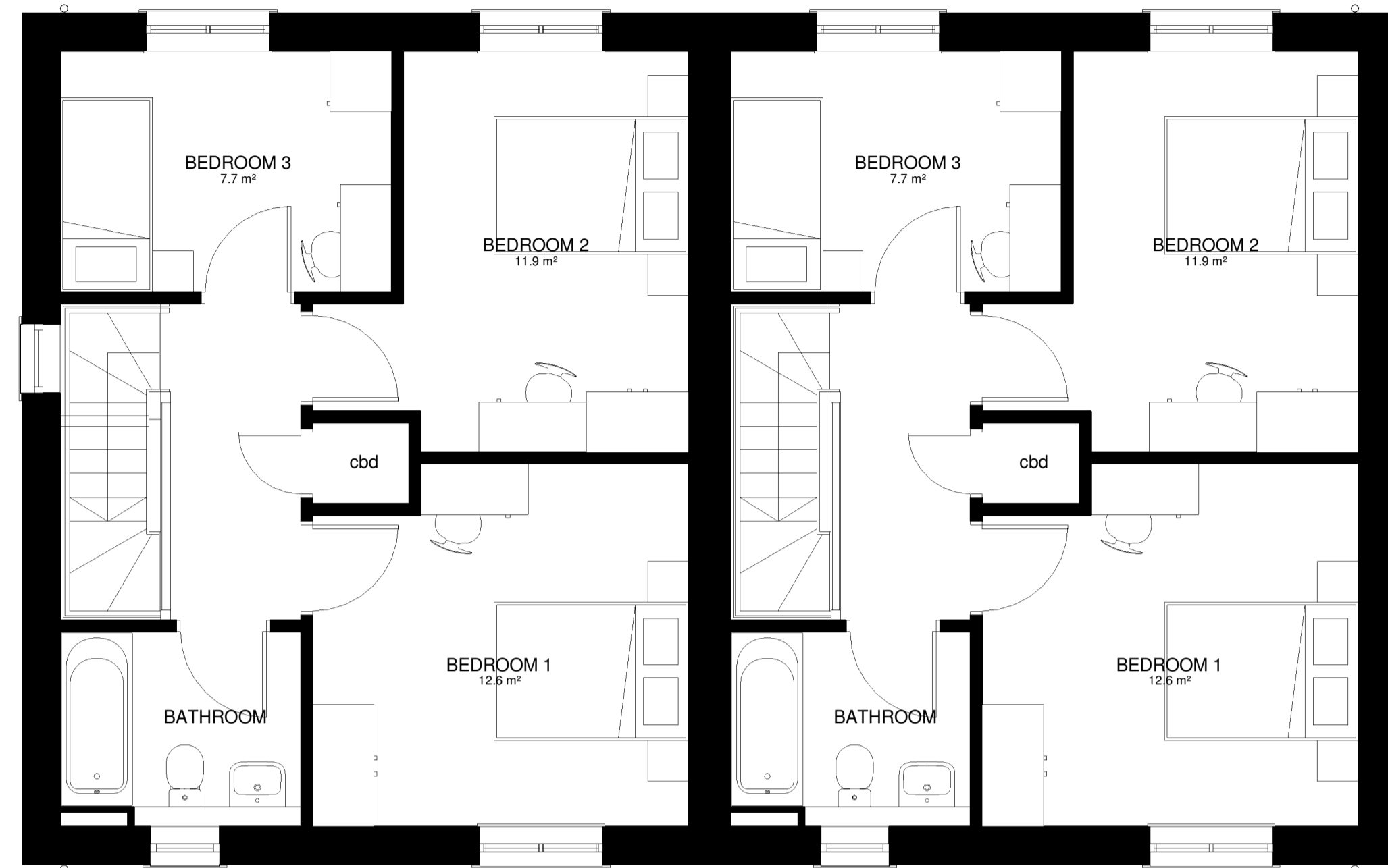
FIRST FLOOR layout 1 : 50