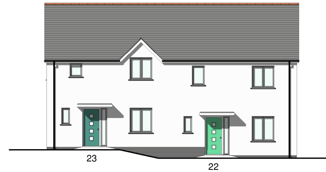
NORTH elevation 1 : 100