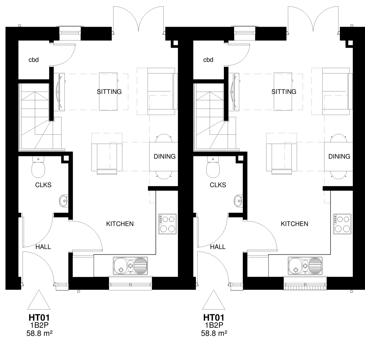
GROUND FLOOR layout 1 : 50