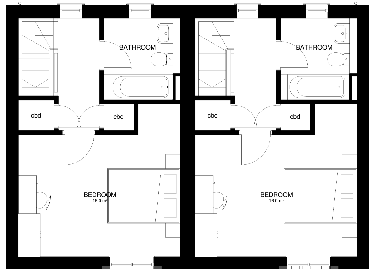
FIRST FLOOR layout 1 : 50