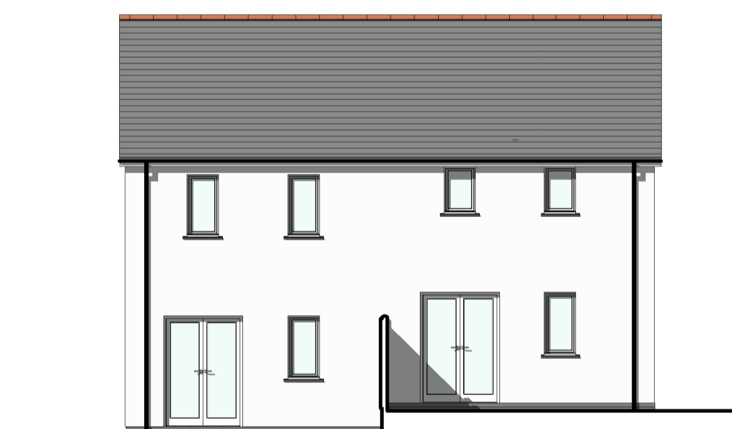
SOUTH elevation 1 : 100