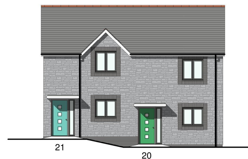
NORTH elevation 1 : 100