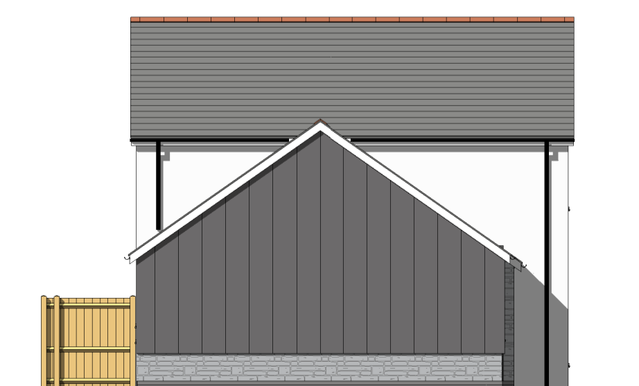
NORTH EAST elevation 1 : 100