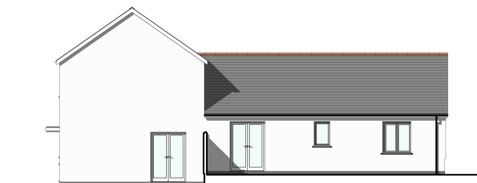
SOUTH EAST elevation 1 : 100