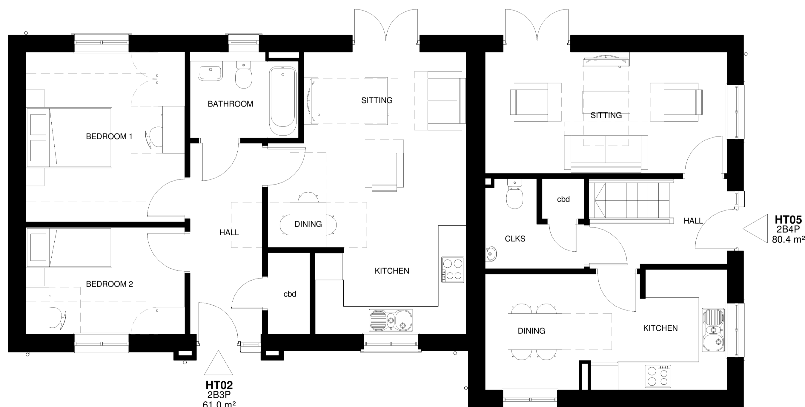
GROUND FLOOR layout 1 : 50