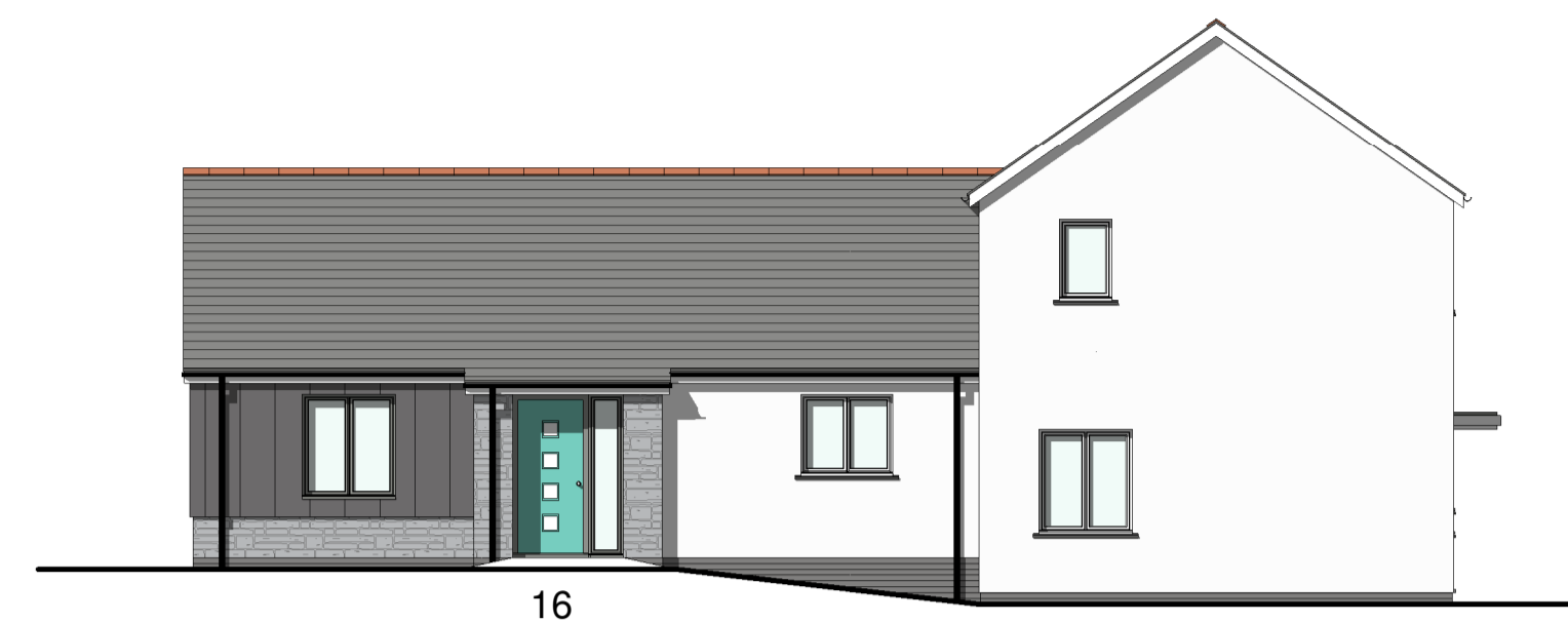
NORTH WEST elevation 1 : 100